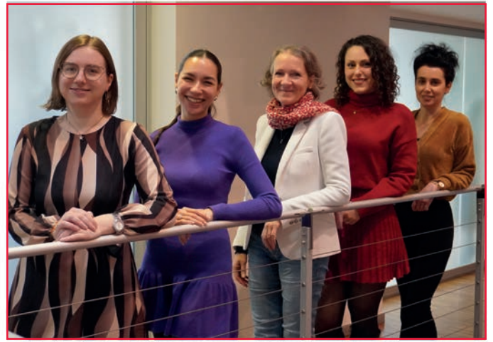
Morgan Team CAD/MASTERMIND Support

Throughout the implementation, Morgan Tecnica provided hands-on training, technical guidance, and prompt troubleshooting. The team supported Shreeji with system setup and file transfers, helping stabilize operations quickly and giving the internal team the confidence to fully leverage the new CAD system.