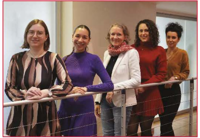
Morgan Team CAD/MASTERMIND Support

Since adopting the new CAD software, the impact has been clearly positive. New technology has brought meaningful improvements, particularly in terms of usability and day-to-day efficiency. CAD operators have responded positively to the intuitive UI/UX, finding the system easier and more comfortable to use.